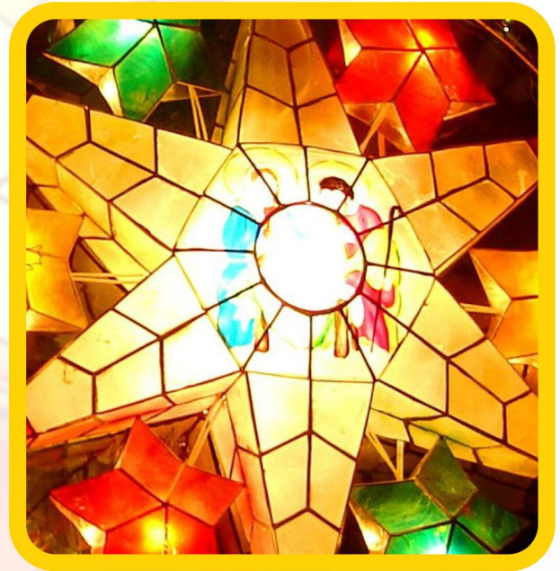
ABOVE: Philippine Christmas Lanterns from the Province of Tarlac

In 2013, we were inspired to import the famous Capiz Parol/Lantern from the Philippines to heartily introduce the Filipino Christmas Culture and Spirit here in Australia. However, it took seven years before we had the opportunity to establish the business. In September 2020, during the height of COVID-19, the first shipment of 350 Capiz Lanterns successfully landed in Victoria. All who bought the lantern were very happy and thankful because it made them feel closer to their homeland especially on the Christmas festive season.